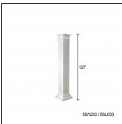
American 4 Columns Cat.No.