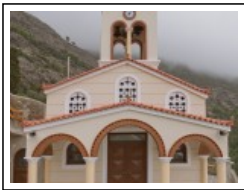
St. John the Baptist Church Churches Jun '11