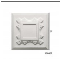
Wave Linear Ceiling Roses Cat.No.