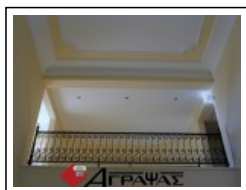
Residence in Pallini Residences Jul '00