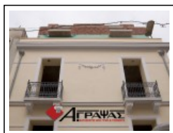
Reconstruction of neoclassical residence Reconstructions Oct '10