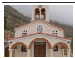
St. John the Baptist Church Churches Jun '11