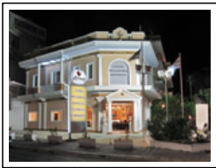
A.Grapsas LTD - Alimos Store Offices/Stores Jul '00