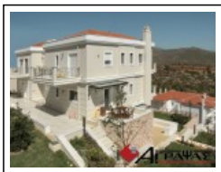
Residence in Pallini, Attica Residences Jan '07