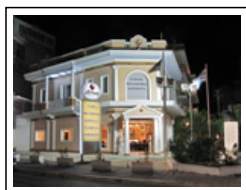
A.Grapasas LTD - Alimos Store Offices/Stores Jul '00