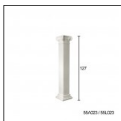
American Columns Cat.No.