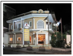
A.Grapas LTD - Alimos Store Offices/Stores Jul '00